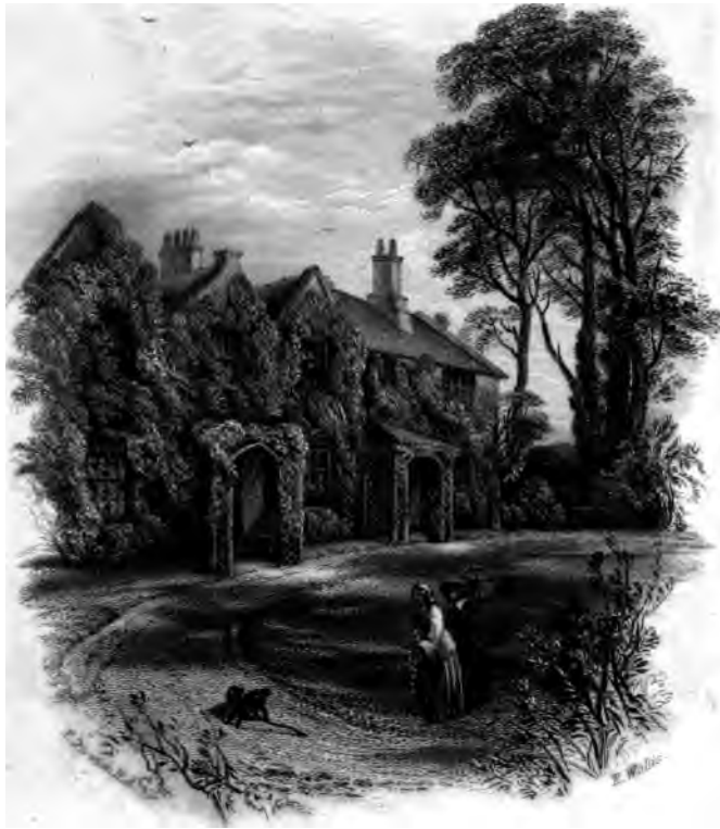
Marble Residence at Newport

LONDON: LONGMAN, BROWN, GREEN, & LONGMANS, PATERNOSTER ROW